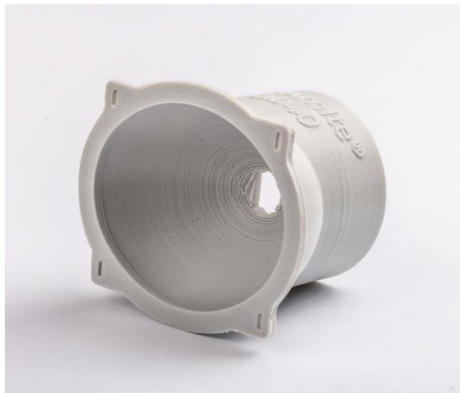
3D printed fog lamp housing